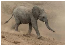
Run for Water, 12 x 18, $300