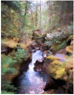
Avalanche Falls, 18 x 12, $108