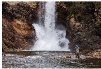
Low Water at Running Eagle Falls, 9 x 13.5, $150