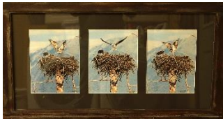
Dinner at the Osprey Nest, 19 x 35 (framed), $450