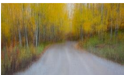
Country Road, 10 x 17, $350