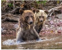
Bathtime Bruins, 20 x 30, $450