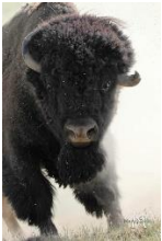
Old Man of the Prairie, 24 x 16, $350