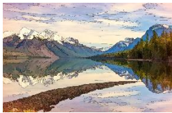
Reflection, 15 x 21, $165