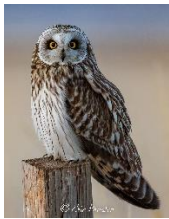
Through the Eyes of an Owl, 30 x 20, $450