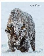
Winter Bison, 22.5 x 18.5, $160