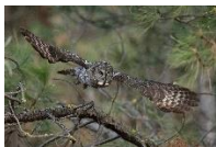
Great Grey in the Trees, 20 x 30, $250