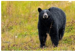
I See You, 15 x 21, $165