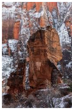
Alter & Pulpit, Zion National Park, 13.5 x 9, $150