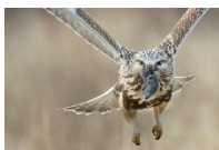
Incoming, 20 x 30, $250