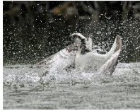
Rising from the Water, 12 x 15, $140