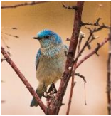
Mountain Sapphire, 12 x 12, $250