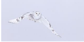
Out of the North, 12 x 24, $270