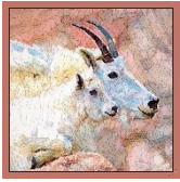
Mountain Goats of Glacier, 16 x 16, $124