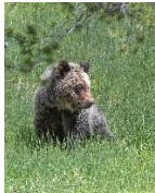
Grizzly Cub, 20 x 16, $130